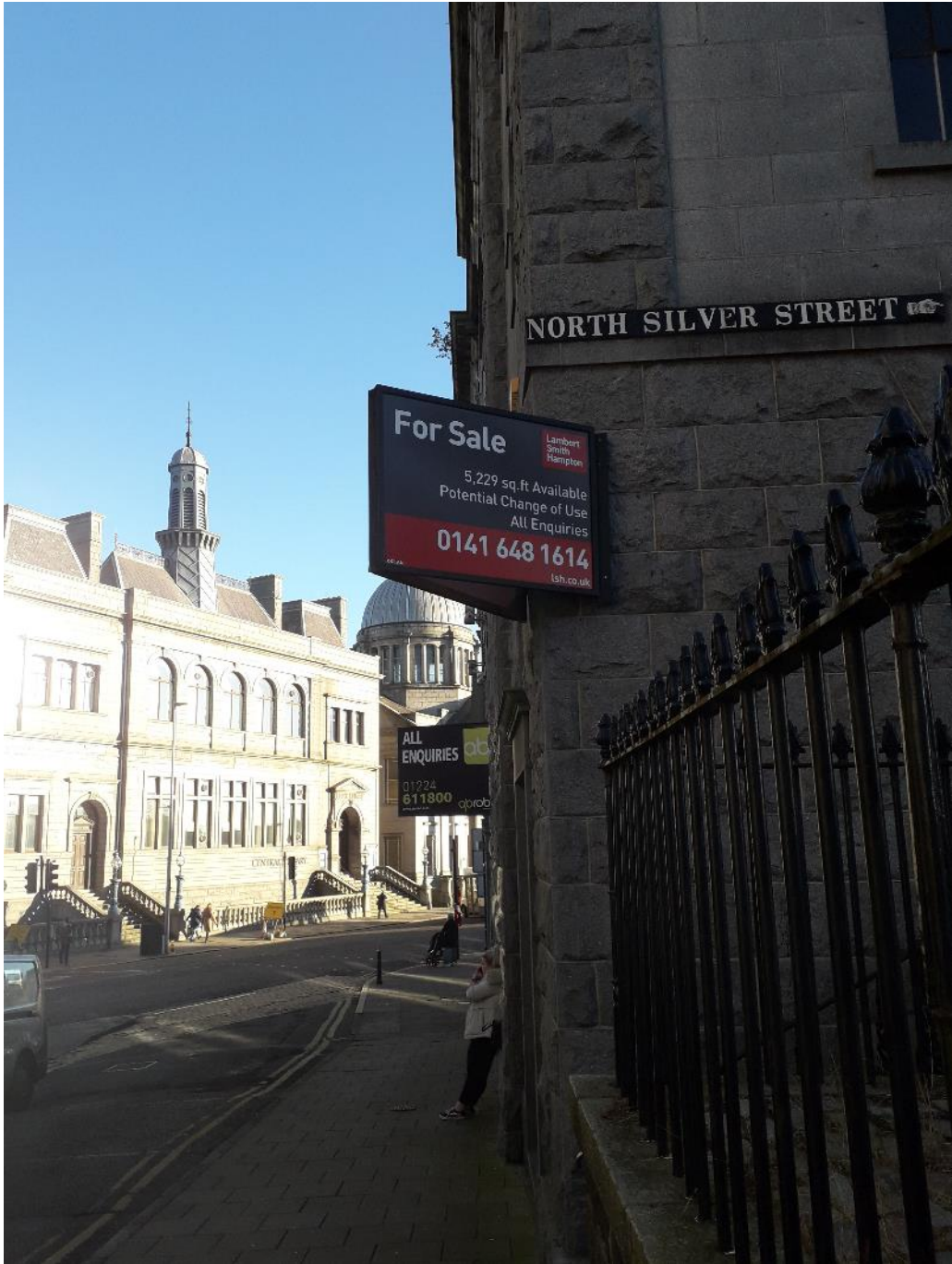
To Let Sign Skene Street