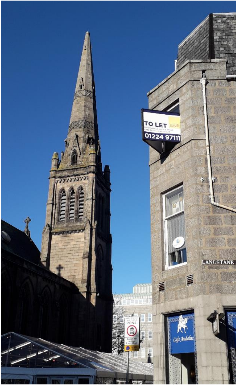
To Let Sign 5 Bon Accord Street