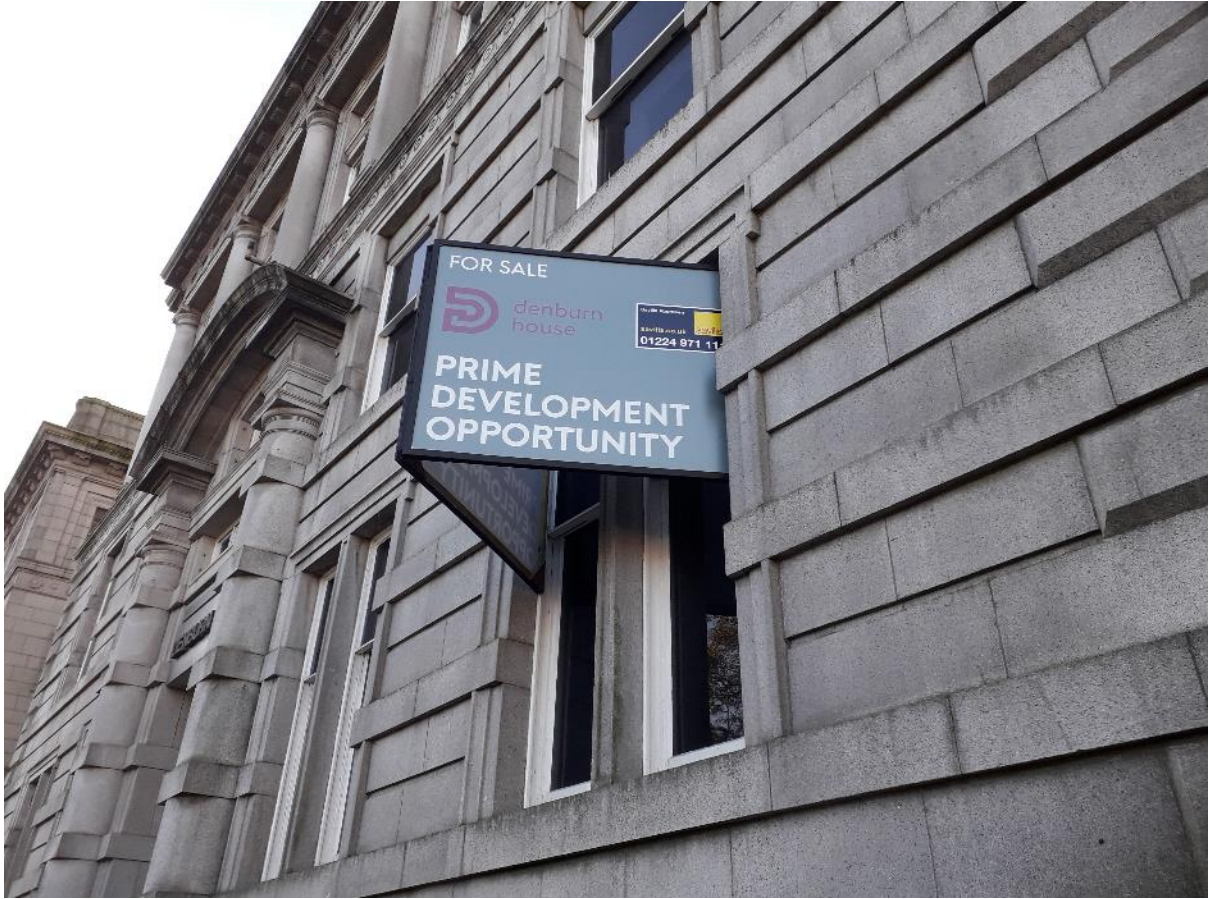
Denburn House To Let Sign